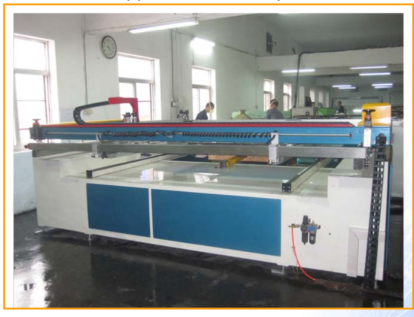
▲ New screen printing machine

A new screen printing machine was installed in the Xiamen factory at the end of February. Newly-hired workers have been training diligently the past few months to operate this new equipment. The maximum production capacity of the new printing machine is 6,300 square meters or approx. 68,000 square feet, translating to approx. 5 containers of 6mm glass each week. The new equipment brings our total printing capacity to 12,600 square meters, or approx. 136,000 square feet.